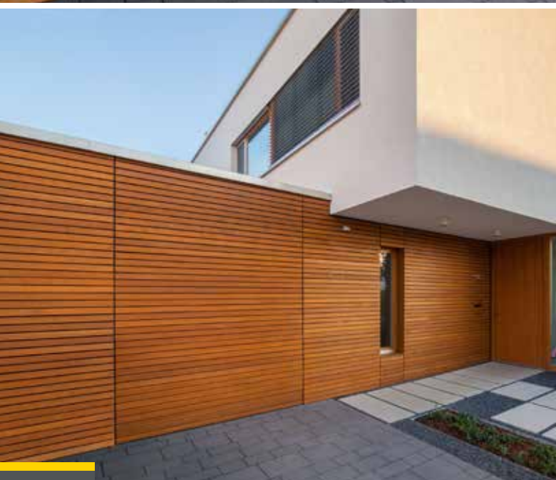
Homogeneous facade in closed condition