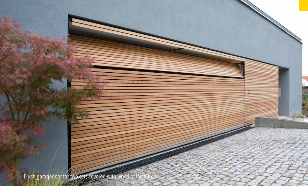
Flush garagedoor for two cars covered with wood of larch tree