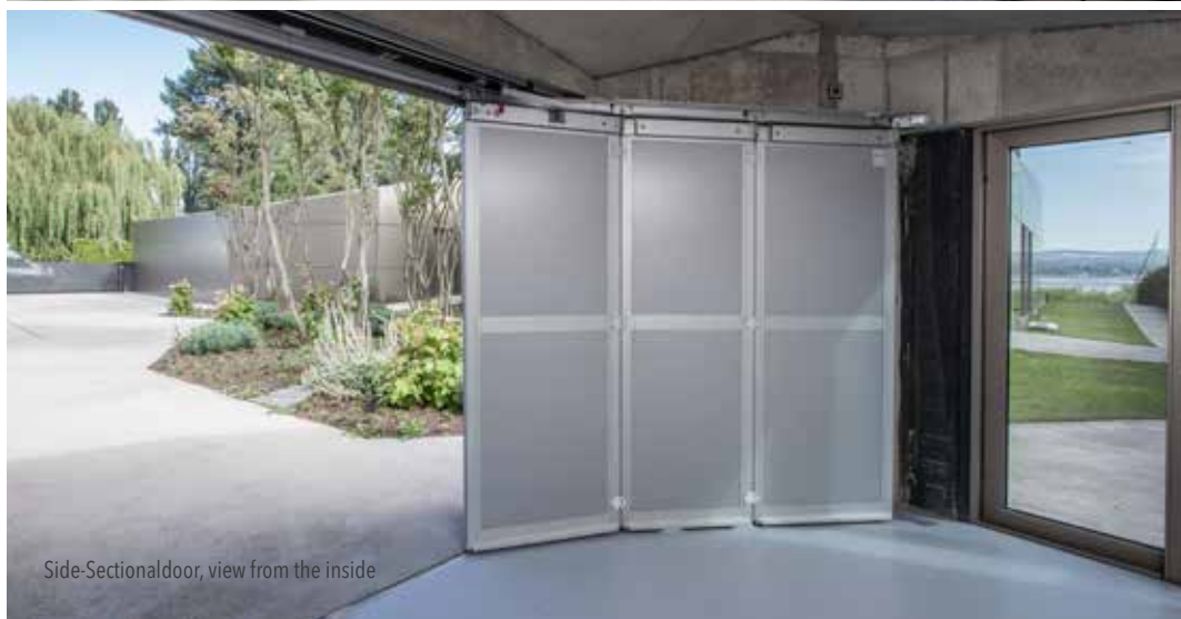
Side-Sectional door, view from the inside