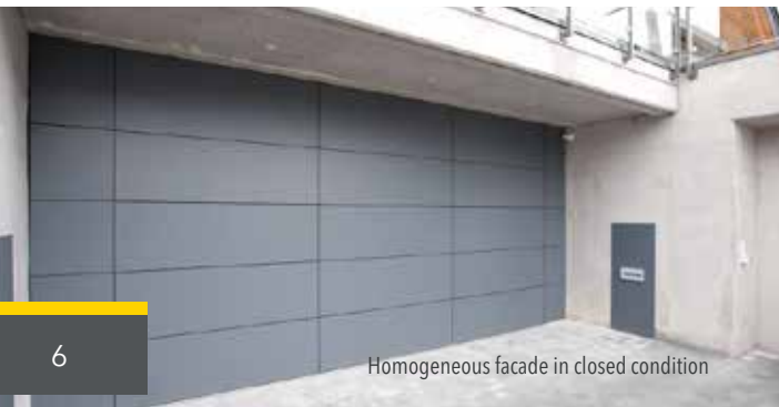
Homogeneous facade in closed condition