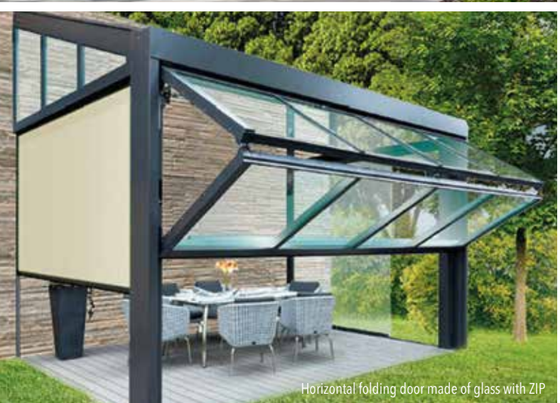
Horizontal folding door made of glass with ZIP