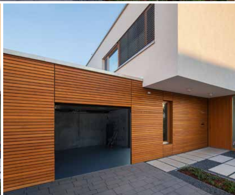
Invisible wood covering without visible screwing of the individual slats