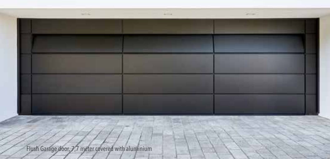
Flush Garage door, 7,7 meter covered with aluminium