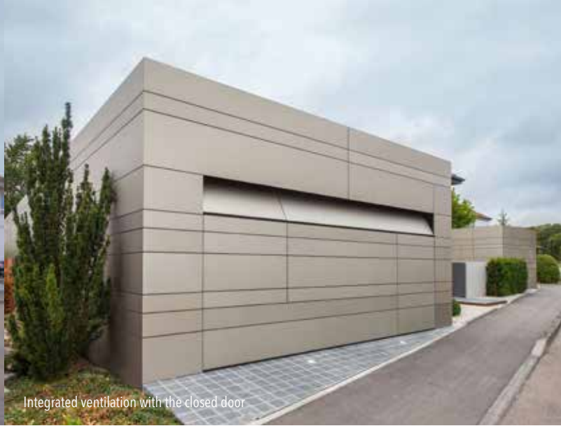
Integrated ventilation with the closed door