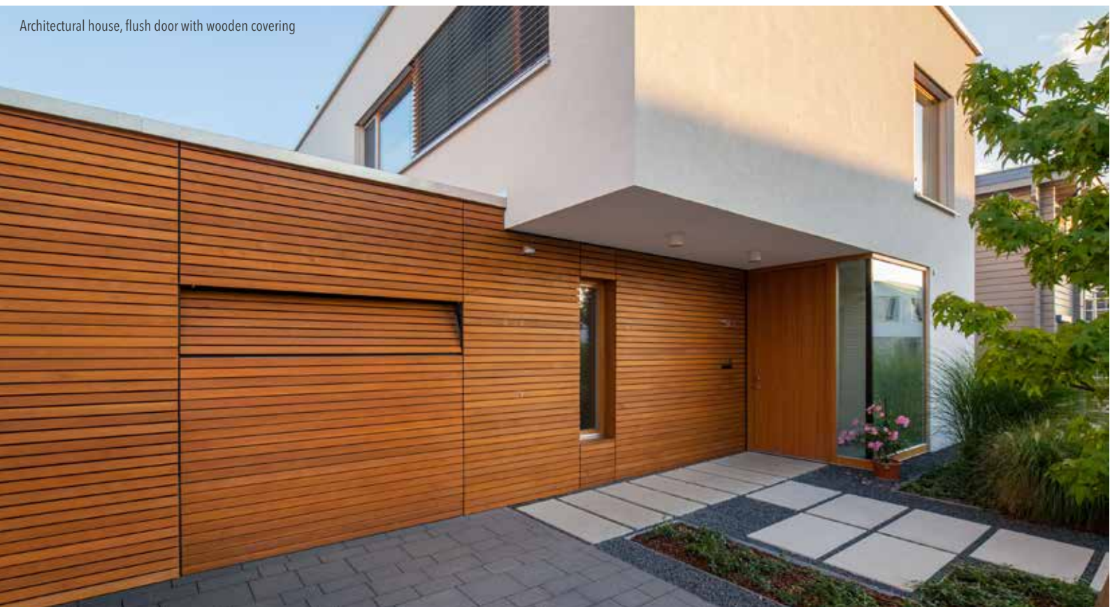
Architectural house, flush door with wooden covering