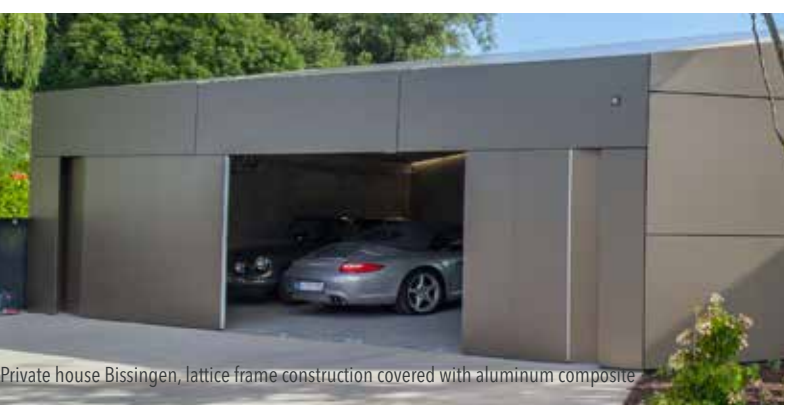
Private house Bissingen, lattice frame construction covered with aluminum composite