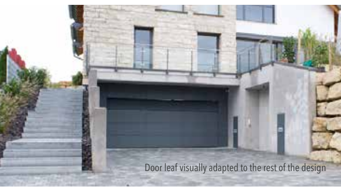
Door leaf visually adapted to the rest of the design

In the project, which is shown below, BeluTec supplied an approx. 5000 x 2200 mm large sectional sectional door. The door consists of an aluminum frame rungs construction with foamed steel sandwich panels. The door leaf is divided into three sections in width and four sections in height. It was prepared for the inclusion of an on-site planking of 10 mm Trespa and 20 mm lathing. The top section of the flush sectional sectional door was designed as a tilting wing for ventilation.