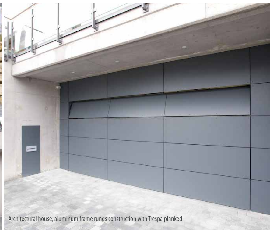
Architectural house, aluminum frame rungs construction with Trespa planked