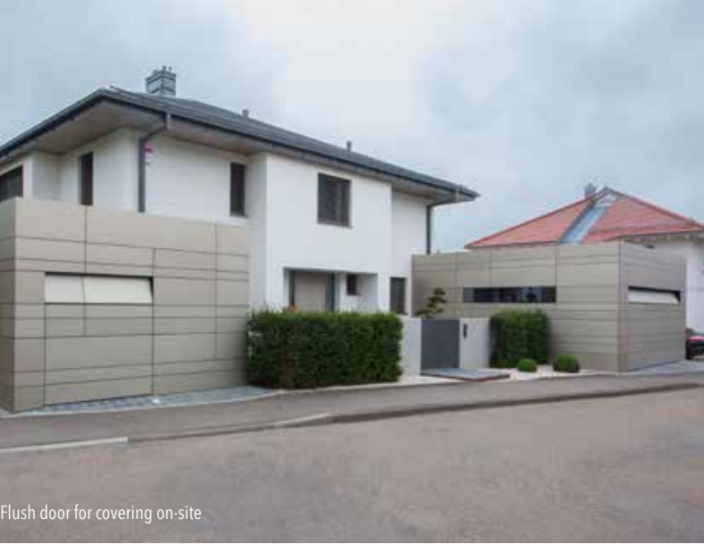
Flush door for covering on-site