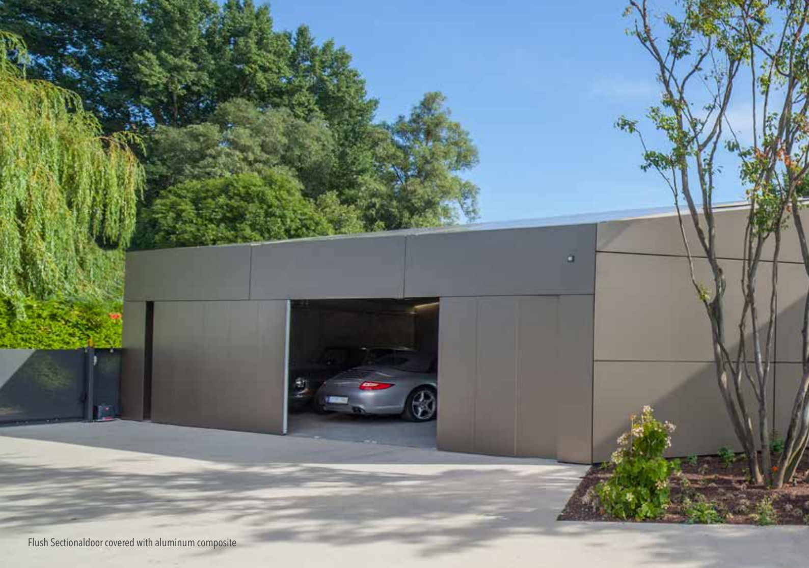
Flush Sectional door covered with aluminum composite